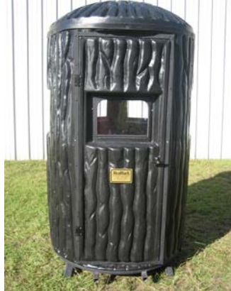
25. Blind assembly complete.