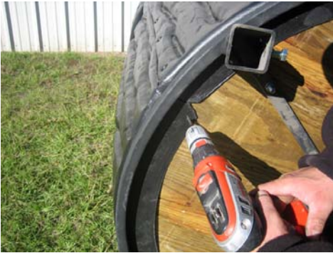
24. Secure panel bottom lip to plywood floor using 3/4" SEM screws. Use 3 screws per panel