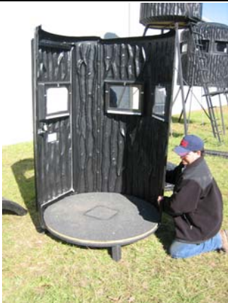
6. Insert second panel the same as first.