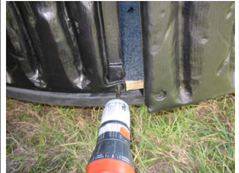
5. To secure position of door panel install a 3/4" SEM screw through the bottom right side of panel into the edge of plywood floor as shown.