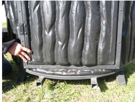
4. Door aligned with ladder brackets