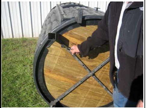
23. Lay blind on it's side and retighten tower ring bolts.