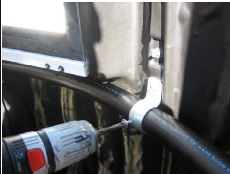
19. Install #2 x 1/2" self tapping screw through EMT strap into pipe.