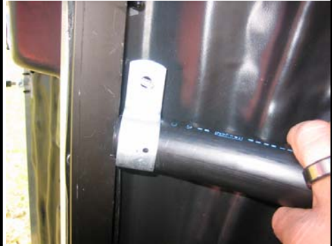
14. Penetrate predrilled hole in door frame with 1 1/4" Phillips head tapping screw and place EMT strap over screw.