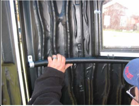
13. Start at door and work around using 1" EMT straps, screws and speed nuts.