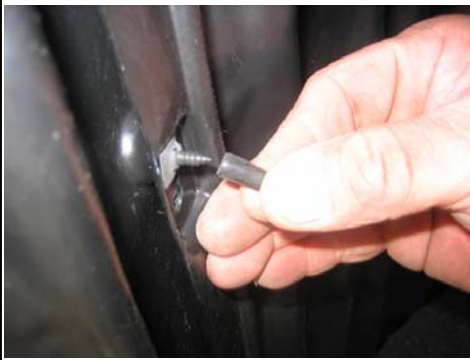
22. Place rubber screw caps on all screw points.