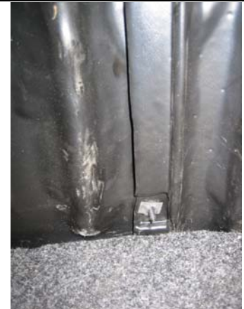
8. After screw penetrates both panels place speed nut over screw and keep turning until nut pulls tight (use pliers to hold speed nut).