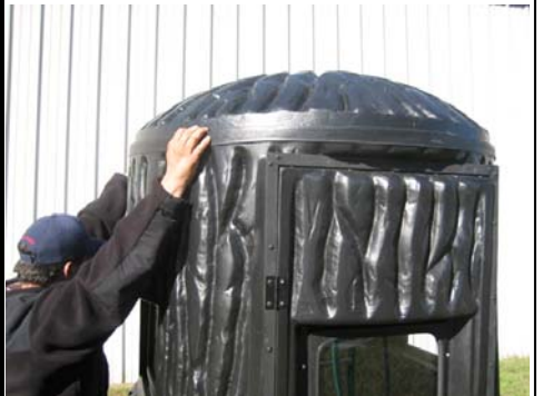
20. Place roof on top of blind.