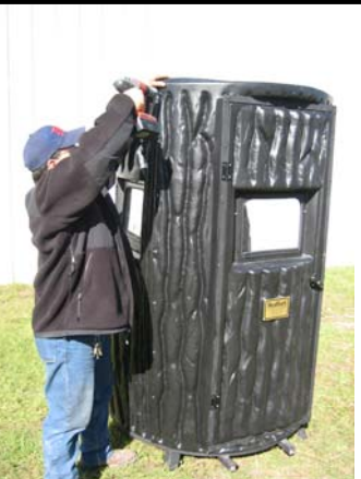
9. Repeat steps 7 and 8 at the top of panel.