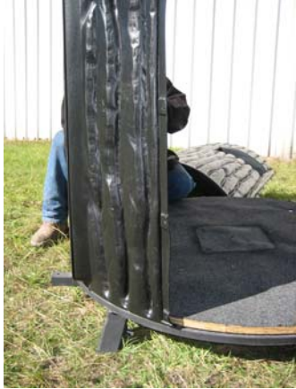
3. Insert bottom lip of blind between 3/4" plywood floor & tower ring.