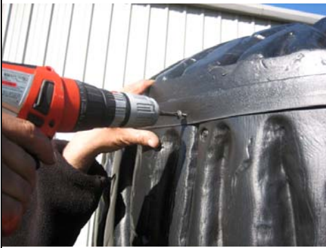
21. Secure with 3/4" SEM screw and speed nut, use 3 screws per side panel.