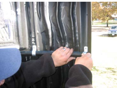
18. Install final door EMT strap same as first one. Make sure pipe is pushed firmly against the wall all the way around and trim end to fit if necessary.