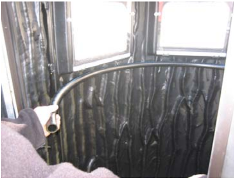
12. Install inner ring against bottom windows.