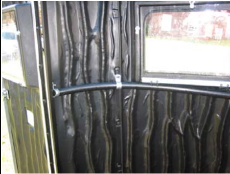
16. Install EMT strap at each seam location keeping pipe against bottom of windows.