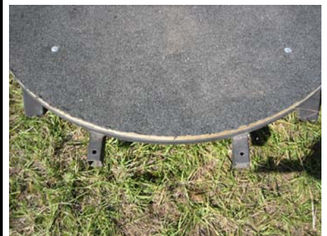
2. Side panel with door should be aligned with the center of door to the center of ladder brackets.