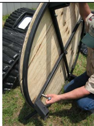
1. Loosen the four floor bolts with 9/16" socket wrench.