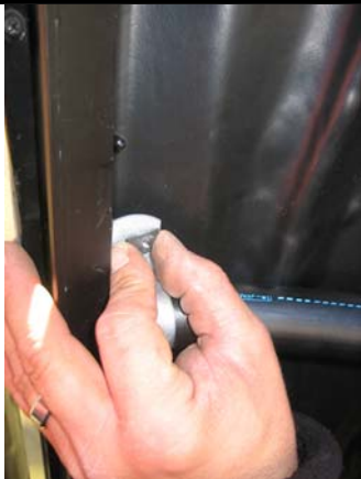
15. Place pipe end against door frame and pull EMT strap tight with speed nut (Use pliers to hold speed nut while tightening).