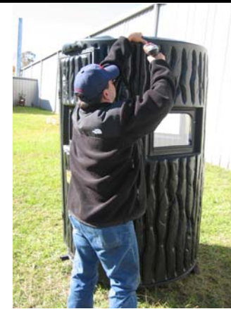
10. Add third panel and repeat steps 7 through 8, then add the fourth panel and repeat.