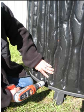
7. Overlap panels as shown and insert 3/4" SEM screw starting at bottom position first.