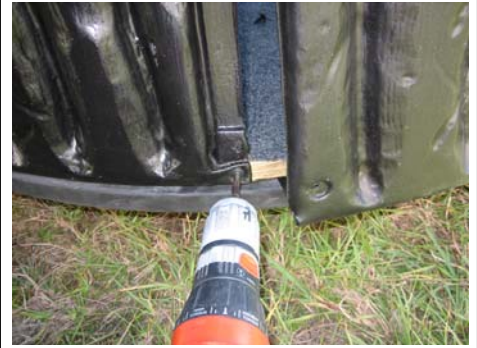
5. To secure position of door panel install a 3/4" SEM screw through the bottom right side of panel into the edge of plywood floor as shown.