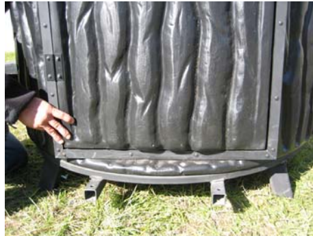
4. Door aligned with ladder brackets