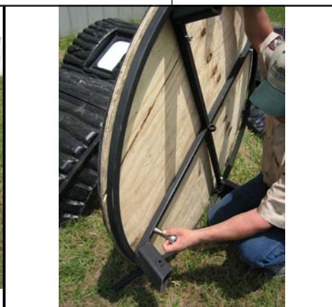
1. Loosen the four floor bolts with 9/16" socket wrench.